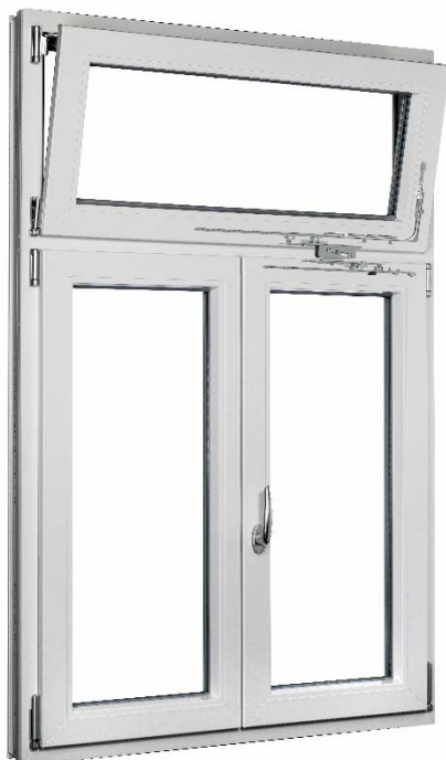
Image: MULTI SKY, for effortless skylight operation from the central handle.

(Concealed hardware between the central sash and skylight sash)