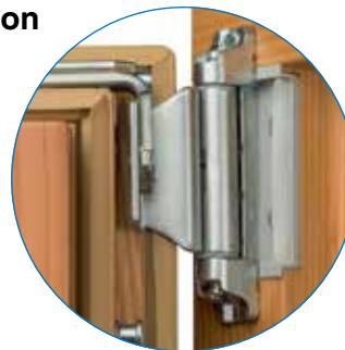
Improved thermal performance thanks to PVC sealing lips

The new double pot basic profile consists of two-component PVC. This means that two different material hardnesses are combined on a component for the first time. The solid, harder body is completed with a sealing lip and a moulded seal on the underside made of softer plastic. The sealing lip ideally compensates for the gaps in the gasket level created by the rebated scissor stay support arm. In addition to the low thermal conductivity of both materials, this ensures that hardly any condensation forms, while the thermal performance is improved.