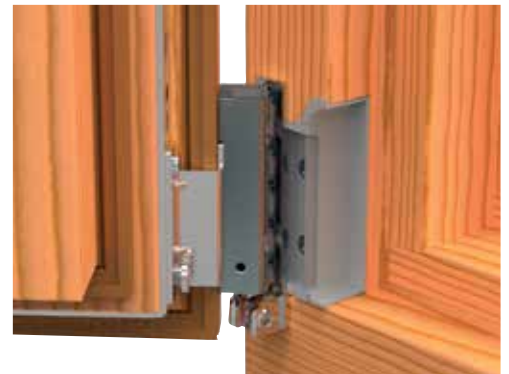
Attractive appearance guaranteed – the necessary routing on 4-gap systems is concealed by covers