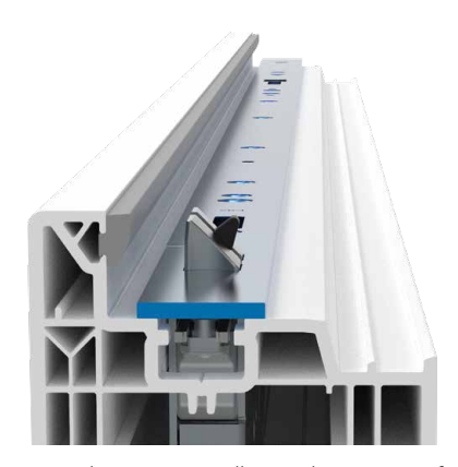
Conceals inaccurate milling at the expense of rebate gap, but not practical