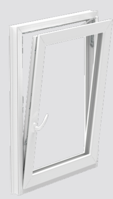
TILTING AT FULL TILT DEPTH