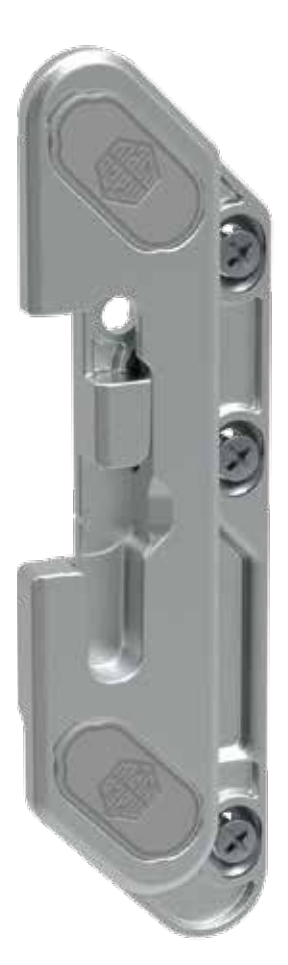
VENTILATION WITH RC 2 THE SASH PROTRUDES 10 MM AT THE TOP: AIR FLOWS IN, RAINWATER IS KEPT OUT.