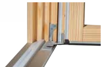
Version for timber