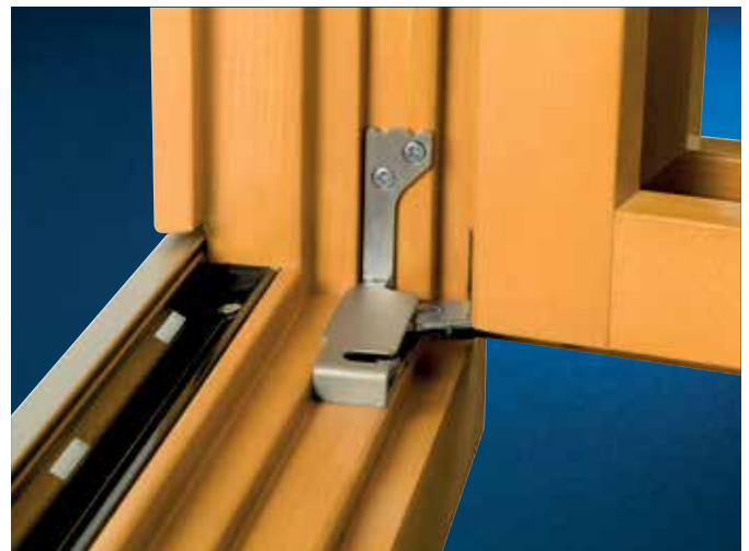
Cover with window manufacturer logo possible.