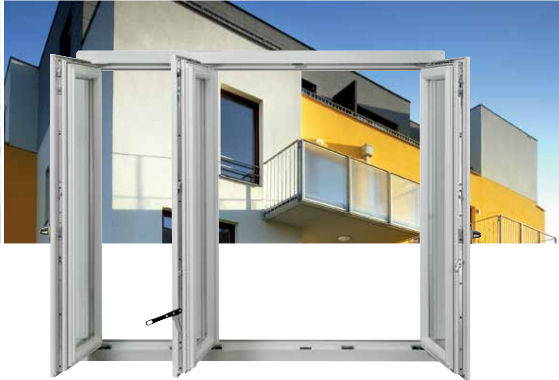
Kinematics for a flush-mounted solution