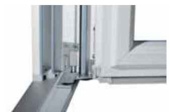
Version for PVC