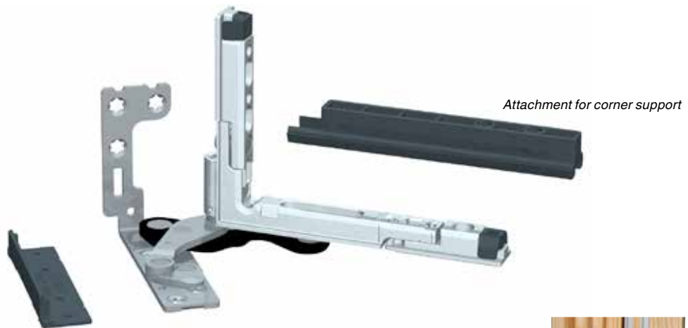
Packer for pivot post